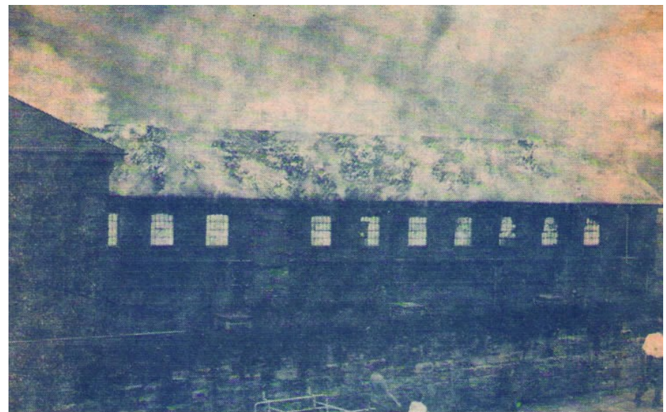
Flames gnaw at the roof of the old British Railways goods depot in the Wicker, Sheffield, at the height of yesterday's blaze. Minutes later the roof collapsed and firemen went to work among the debris below

The roof collapsed in stages and as the flames and smoke rose into the air as a strong updraught sucked fresh air in through the building's open ends and broken windows, fanning the blaze. During the late afternoon a light, southwesterly breeze was blowing and it was not, until evening that rain began to fall.