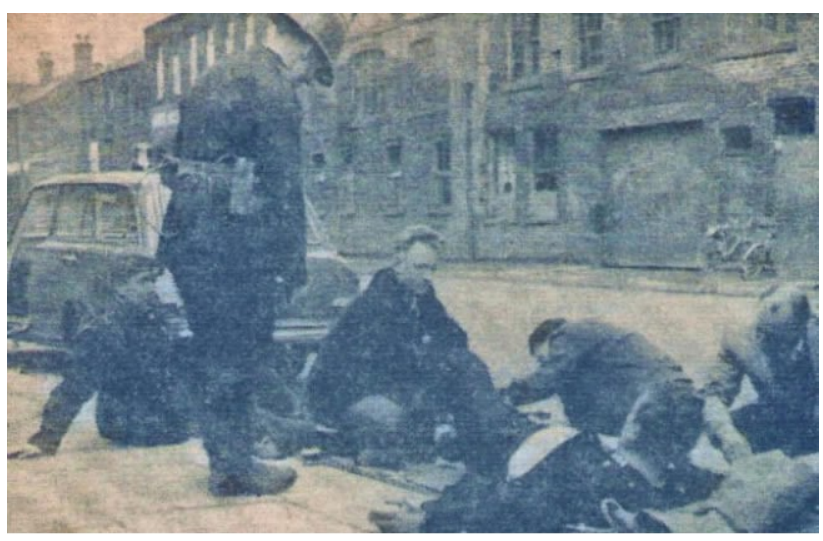
Kerbside help for more firemen injured in fighting The Wicker blaze

Until- late at night Savile Street was the scent of intense fire brigade and police activity.