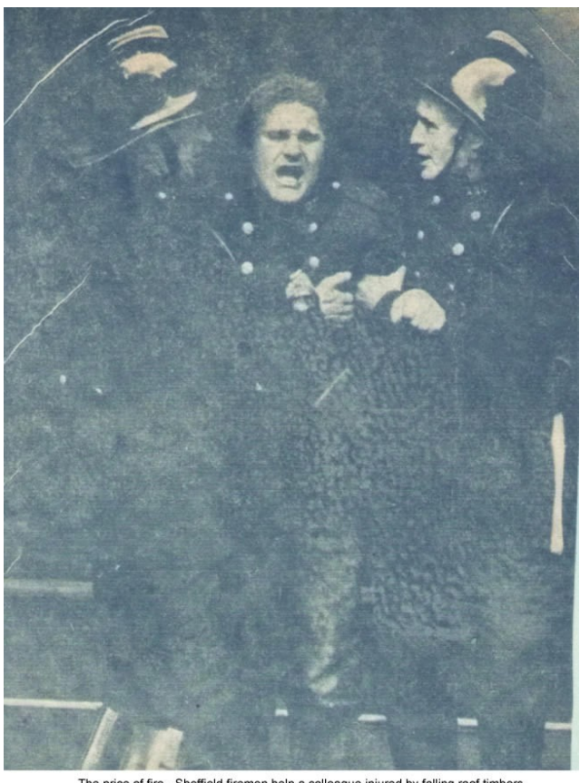
The price of fire - Sheffield firemen help a colleague injured by falling roof timber

For a brief second it looked as though two of the firemen were buried. The crowd outside on the road were hushed.